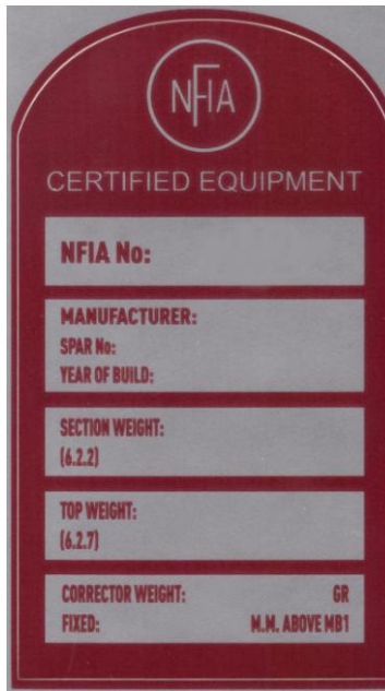
previous label format